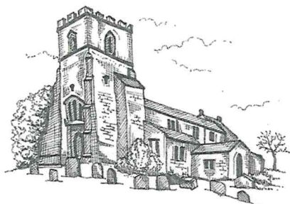
St Margaret's, Chippenham

Chippenham, Fordham, Isleham, Kennett & Snailwell