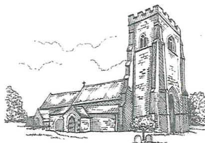
St Nicholas', Kennett