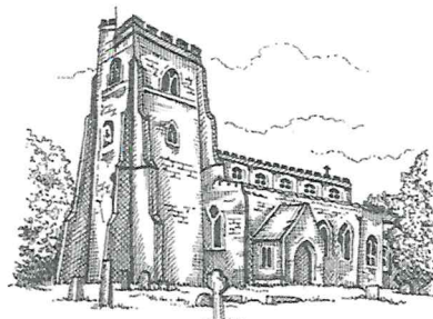
St Peter & St Mary Magdalene, Fordham