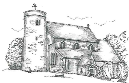
St Peter's, Snailwell